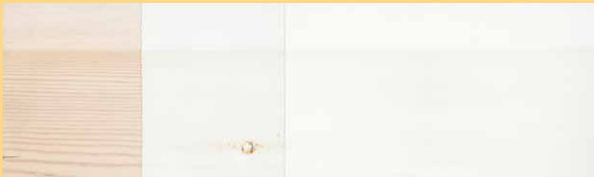
Test of tannin bleeding with competitor product on pine.