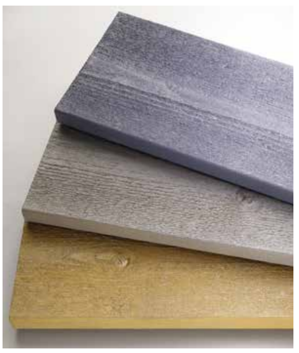
(1) Lavender + 1% WV 810, (2) Mineral grey + 1% WV 810, (3) Gold satin + 1% WV 810

Metallic-look wood - this is the start of a new, fascinating trend. With its very special appearance, the metallic effect lends the natural material its own visual appeal. The effect can be varied by adjusting the amount of metallic pigment added. The amount added should not exceed 5%.