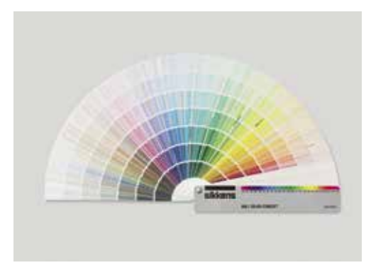
Sikkens 5051 colour fans