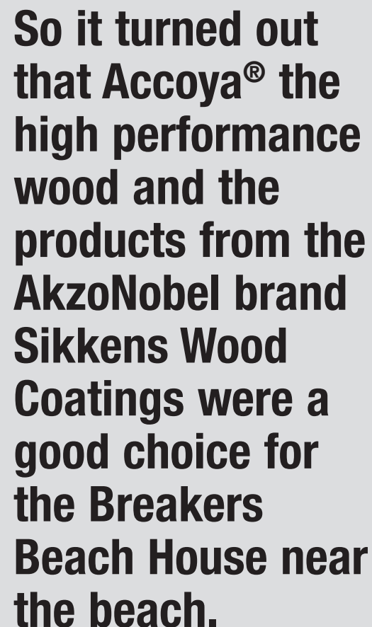
extreme weather conditions